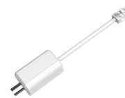
LR1002 ePoE Over Coax Converter